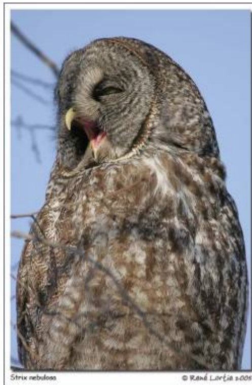
Figure 1: Owl

Figure 1 displays a magnificent owl from Lapland.